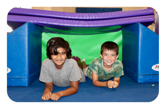
Junior Ninjas: Ages 6-8 Wednesdays, 5:20 PM - 6:05 PM Fridays, 5:05 PM - 5:50 PM

Wednesdays, 4:45 PM - 5:15 PM W Thursdays, 10:30 AM - 11:00 AM F Fridays, 4:30 PM - 5:00 PM Saturdays, 10:40 AM - 11:10 AM, 11:15 AM - 11:45 AM